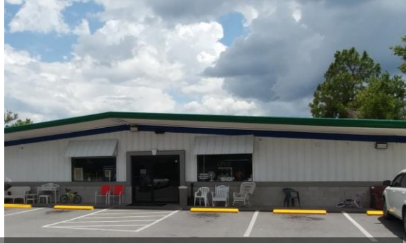
Crystal River Location